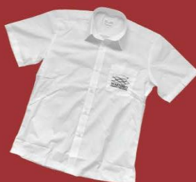
Upper school collared shirt