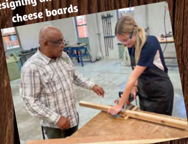
Designing and making cheese boards

Students in technologies are making some great wood work designs. On my visit they were finishing table lamps and some were starting to make cheese boards.