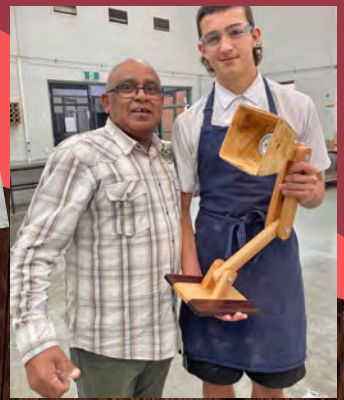
Designing and making table lamps